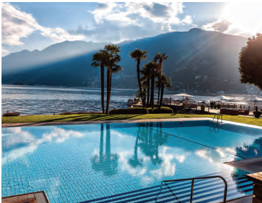
Eden Roc Hotel pool

At the end of a relaxing day, retire to your room. Each guestroom has been individually appointed, with quirky, colourful features and bold artworks which inspire a themed colour scheme. All are spacious, with textured, tactile fabrics, and large windows and balconies that open up onto unbeatable views. For the ultimate Ascona experience, upgrade at the time of booking to a room with a direct lake view. The area around Ascona is perfect for day excursions, with plenty of cultural activities