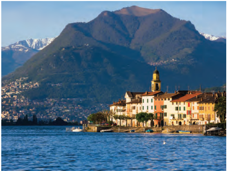
Lake Maggiore, Ticino